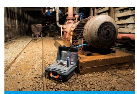
For the toughest working conditions