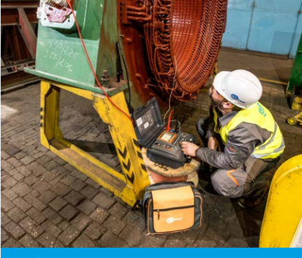
Professional diagnostic tool