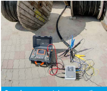
Several measurements in one connection